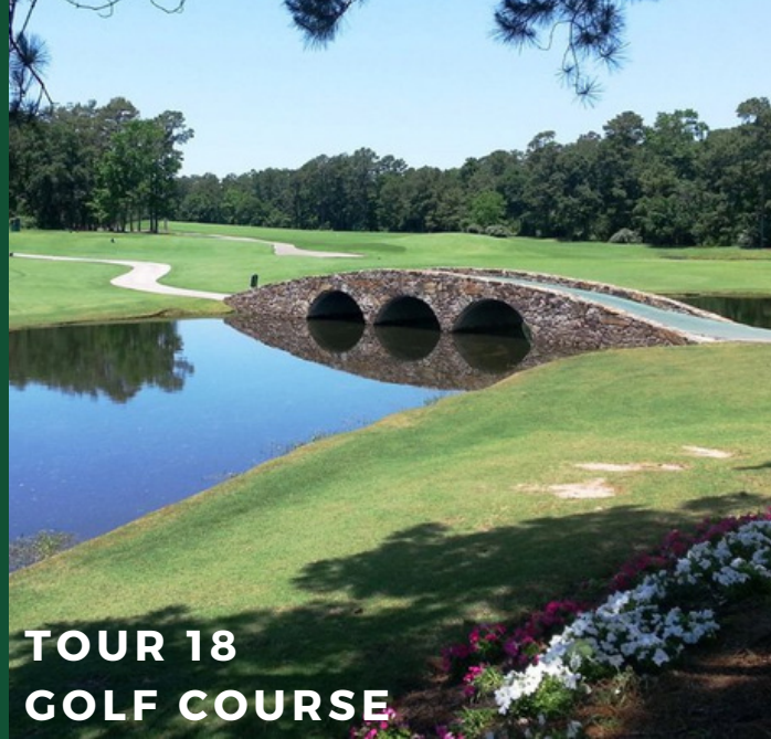
TOUR 18 GOLF COURSE

In consideration of my entry, I, my heirs, executors and administrators, waive all claims, release from liability, and agree to hold harmless, St. Monica Food Pantry, Tour 18 Golf Club, their agents, members, and sponsors of this event. I understand that this tournament entails personal risk, including serious bodily injury and even death, and I voluntarily assume that risk. I recognize the physical exertion involved in the event and attest and certify that I am physically fit to compete safely, and have not been advised otherwise by a health care professional.